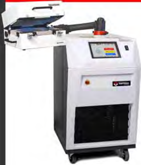
MOBILETEMP™ system configured with Clamshell style THERMOCHAMBER™ & THERMOSTREAM® temperature source