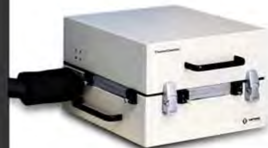
The FLEXEXTENDER™ air hose easily connects the THERMOSTREAM® air supply to the right or left side of the THERMOCHAMBER™