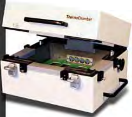
With the top loading Clamshell style THERMOCHAMBER™, adding or changing DUTs or cables is quick and convenient