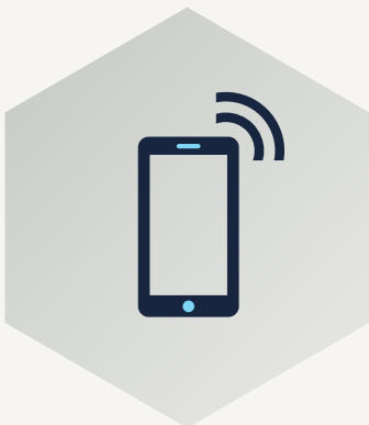
Broadcast & Commercial