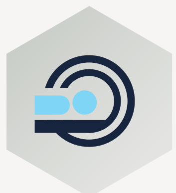
Industrial, Scientific & Medical