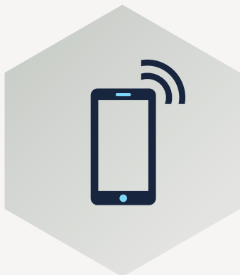
Broadcast & Commercial